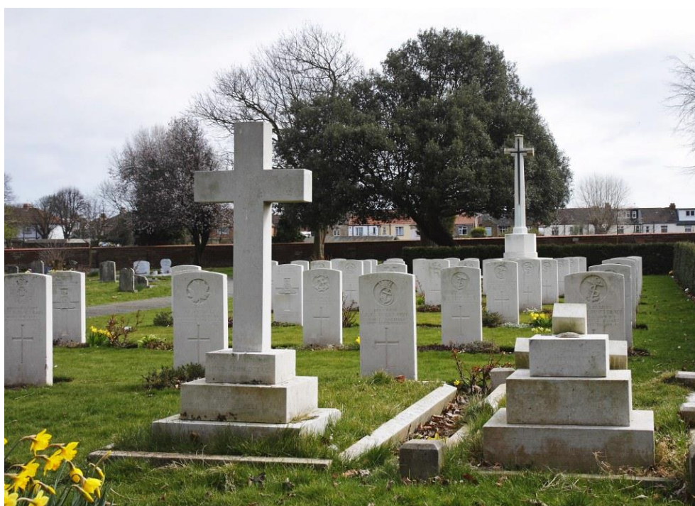
Ramsgate Cemetery, Kent