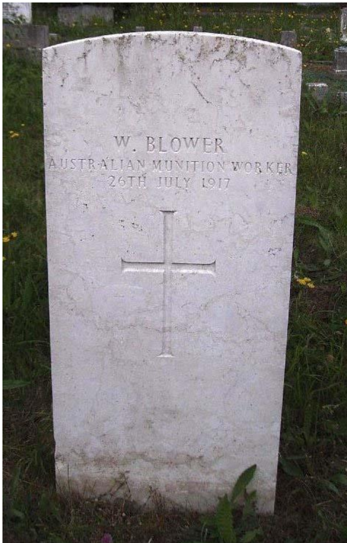
Photo of Munition Worker William Blower's Commonwealth War Graves Headstone in Ramsgate Cemetery, Kent, England.