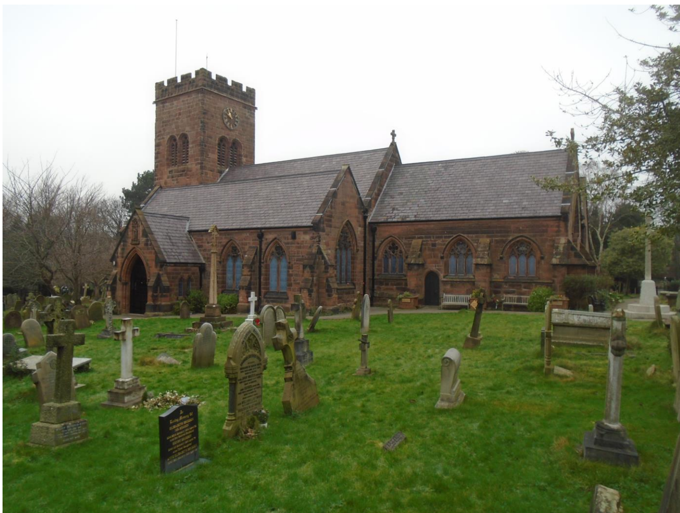
St. Bridget's Church, West Kirby

St. Bridget's Churchyard, West Kirby contains 11 Commonwealth War Graves – 9 relating to World War 1 & 2 from World War 2.