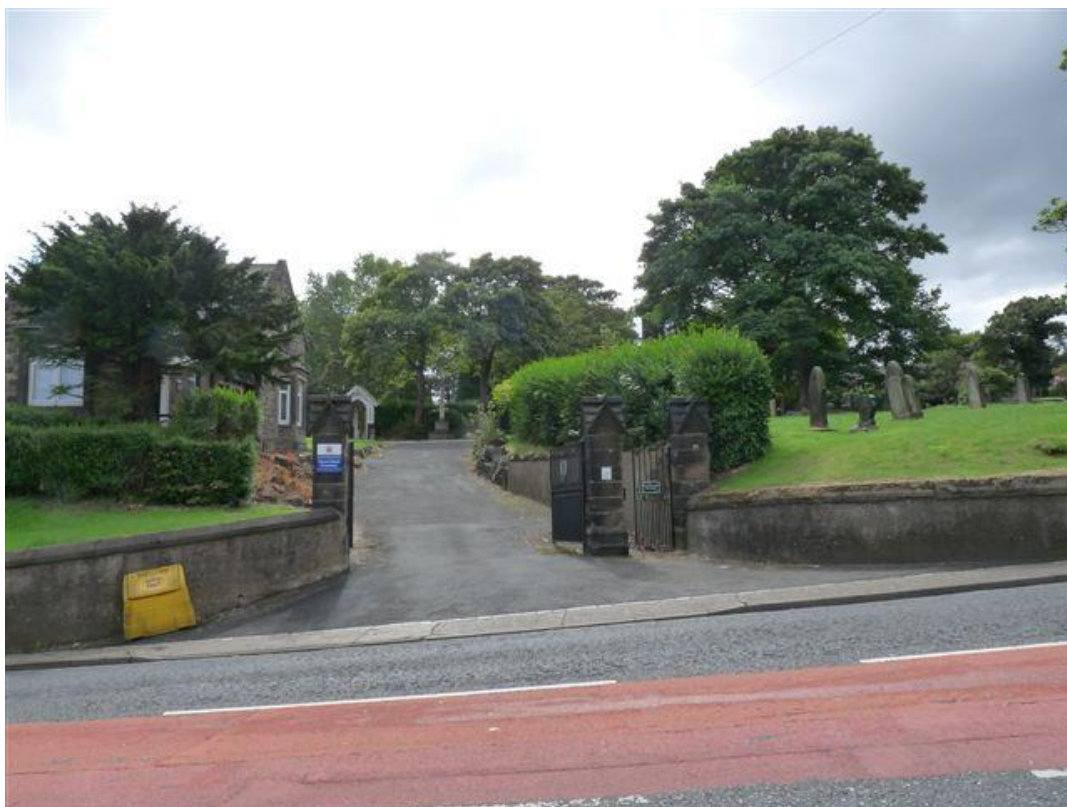
Church Bank Cemetery, Wallsend

Church Bank Cemetery, Wallsend contains 60 Commonwealth War Graves – 48 from World War 1 & 12 from World War 2.