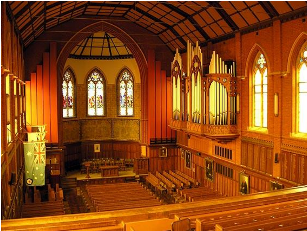
Memorial Hall at Scotch College, Melbourne