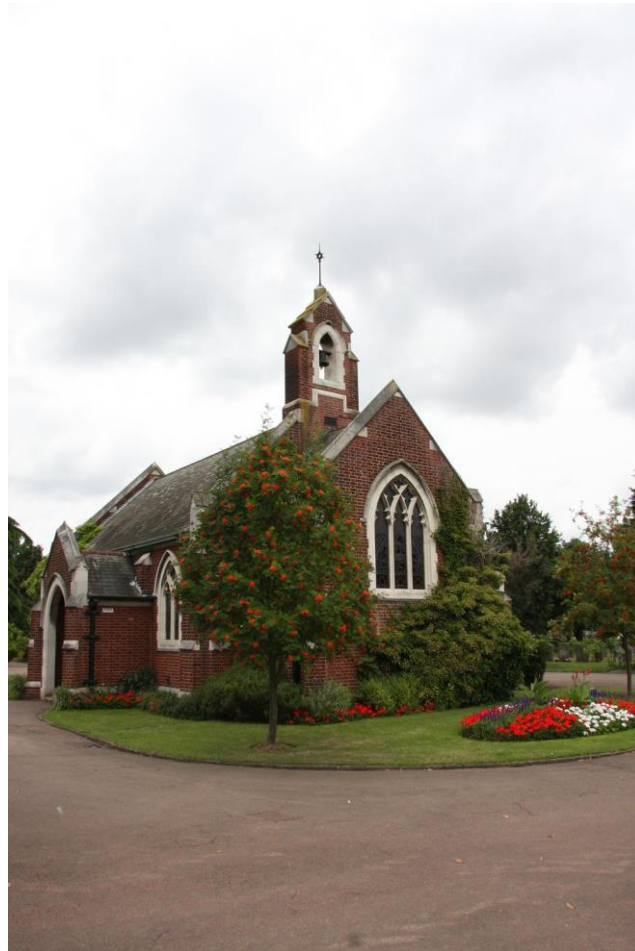
North Sheen Cemetery, Richmond