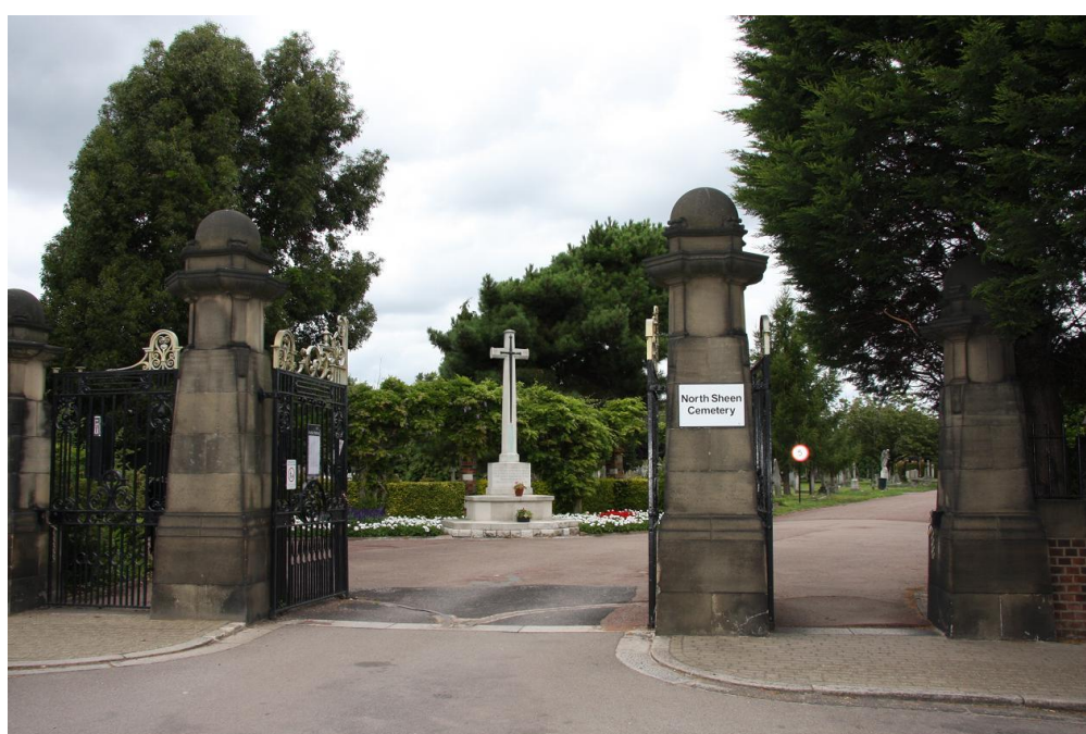
North Sheen Cemetery, Richmond

There are 9 WW1 Australian Munition Workers buried here as well as 1 WW1 Royal Flying Corps Officer (born in Australia)