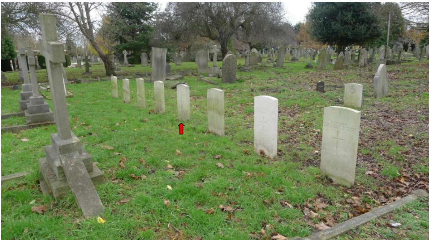
Australian WW1 Munition Workers' CWGC Graves in North Sheen Cemetery Frederick Eyton's Headstone marked with red arrow