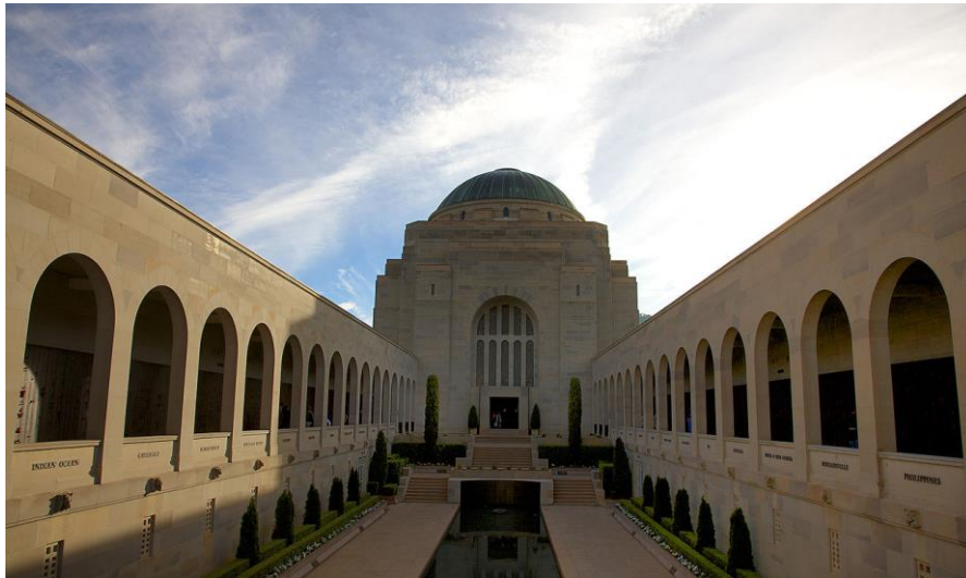
Commemorative Area of the Australian War Memorial