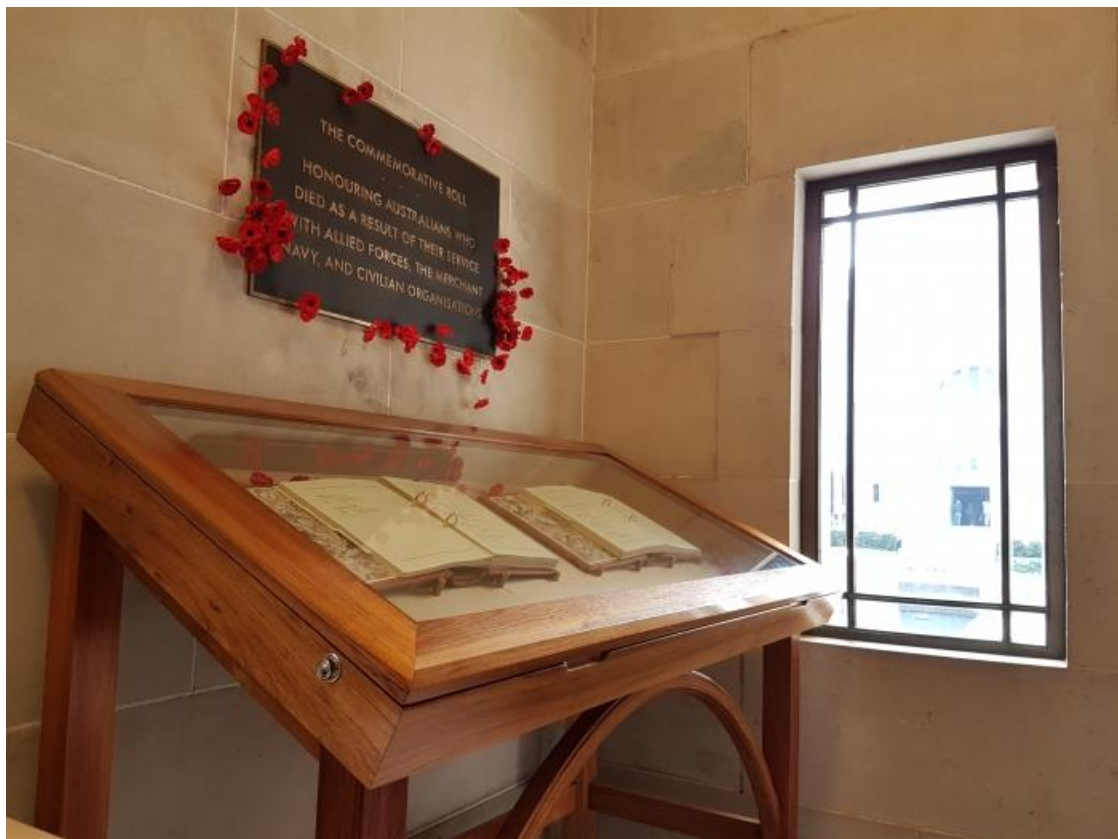
Commemorative Roll