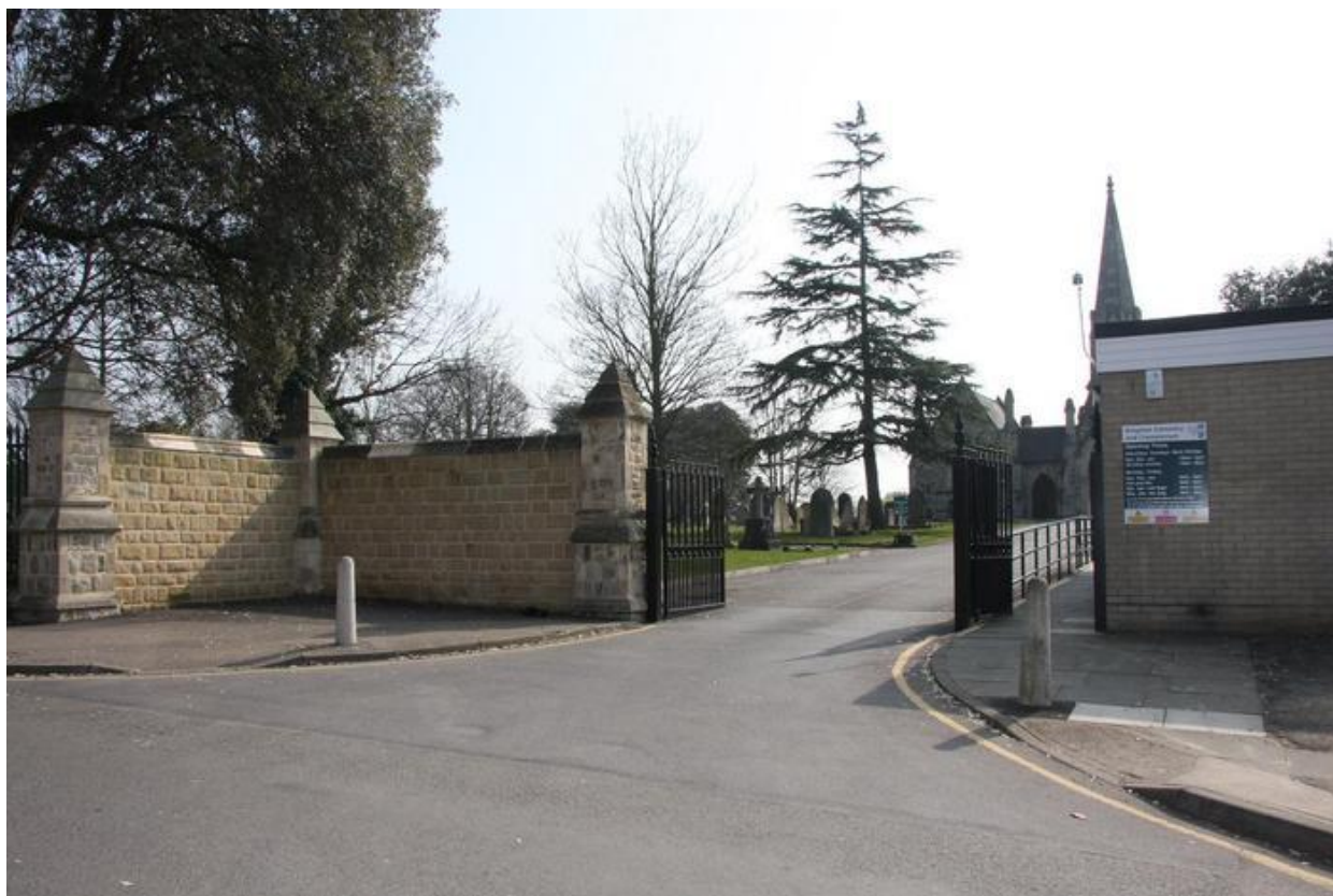
Kingston-Upon-Thames Cemetery

Kingston-Upon-Thames Cemetery contains 165 Commonwealth War Graves – 106 from World War 1 & 59 from World War 2. (Information from CWGC)