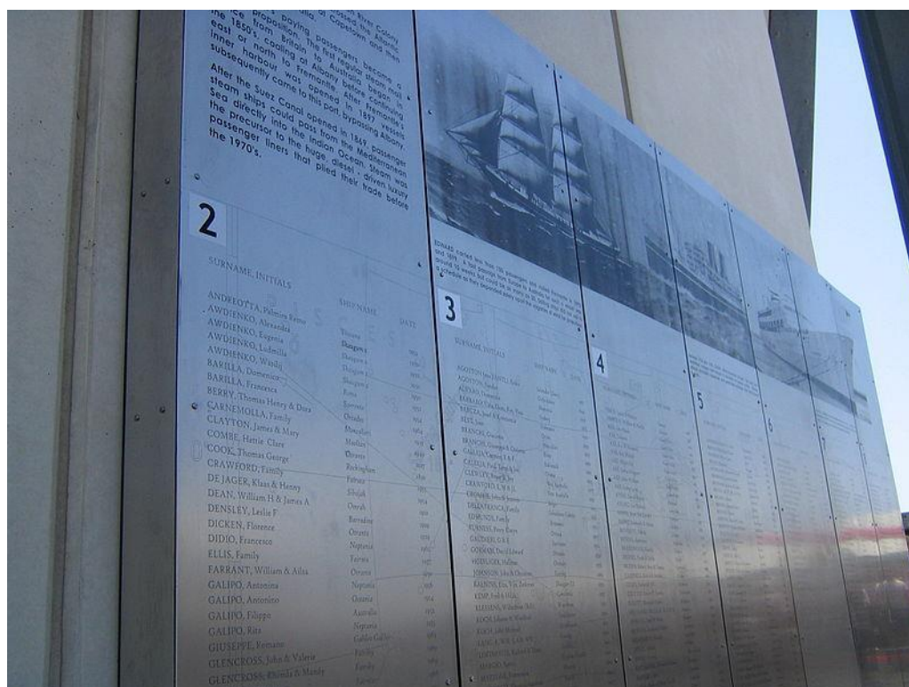
Example of Western Australian Maritime Museum Welcome Walls