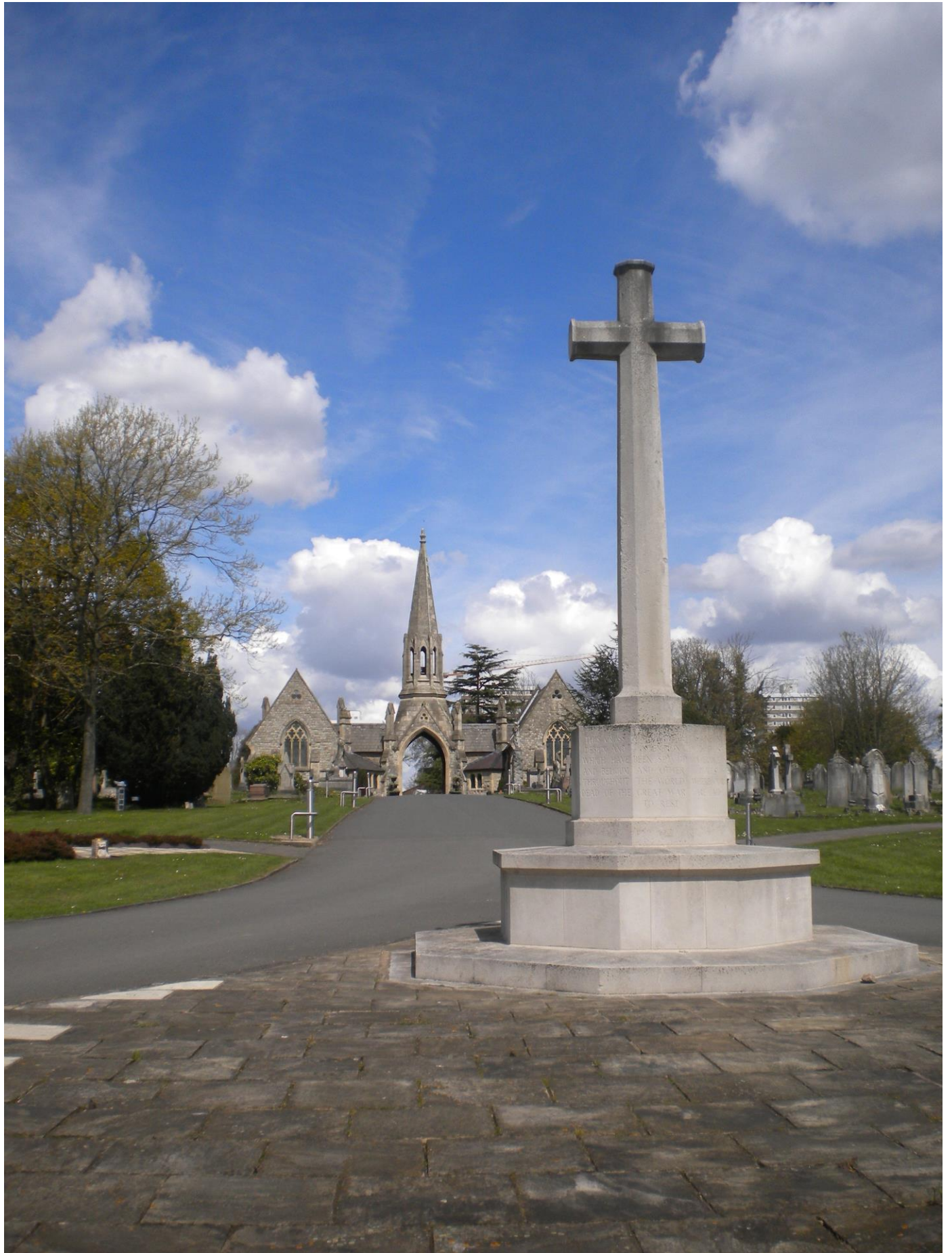
Kingston-Upon-Thames Cemetery